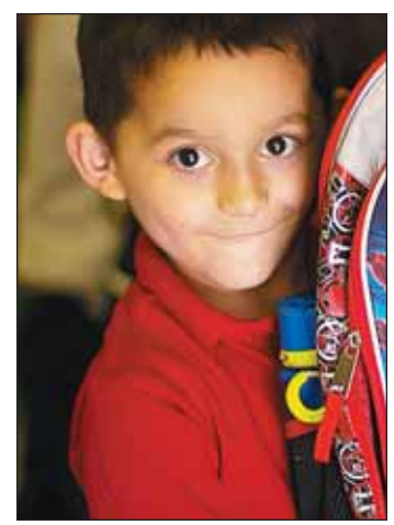
A McCurdy preschooler

Every donation of labels McCurdy sends to Campbells Labels is banked until we spend the points. At this date there are 455,421 points in the McCurdy account. Our goal is to replace another one of our aging McCurdy vans by accumulating another 1,600,000 points. So here is the challenge: help McCurdy Ministries accumulate 1,144,579 labels by the end of 2016 to secure a new van! We invite you to go through your cupboards and drawers in the kitchen where you 'stash' those UPC labels and to remind everyone at church to collect their labels for McCurdy. Then we invite you to send the UPC labels to McCurdy Ministries at 362A S. McCurdy Road, Española, NM 87532.