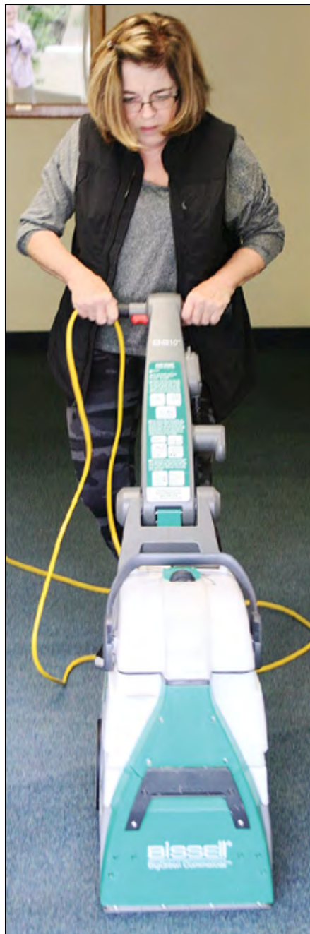
A volunteer from Dothan, Alabama, cleans carpet in the Retreat Center.