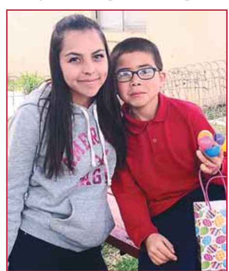
A Buddy team enjoy their Easter Egg Hunt together.

themselves have developed skills in their mentoring relationship, and developed