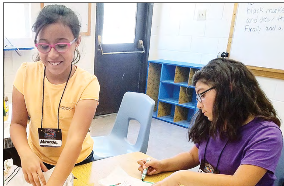
Camp Stars students take part in a science lesson during Camp Stars 2018.

Camp Stars staff worked collaboratively to provide enriching lessons within the science and math stations that were connected to the overall theme. Campers were provided nutritious breakfast and lunches in partnership with the Rio Arriba County Summer Food Program, and were given nutritional information handouts. Participants heard a presentation from Blue Star Mothers Inc. about supporting American troops and made over 100 Christmas themed greeting and thank you cards for the troops. They also heard programs from the Española Valley Nursing and Rehabilitation Center, STOP (Substance Treatment Outreach Program), the New Mexico State Police and Heifer International. Campers made cards and visited residents at the Rehabilitation Center, pledged to stay away from drugs and alcohol substances, collected $5.82 for Heifer International, and even got to turn on the police siren during the visit from state police. They also took two field trips to a bowling alley and an outdoor pool for a day of fun. Camp ended with an open house and closing ceremony for parents to enjoy presentations, hear praise and worship songs and witness what their children learned during the summer. McCurdy thanks the Montei Foundation and other donors for their continued support of Camp Stars!