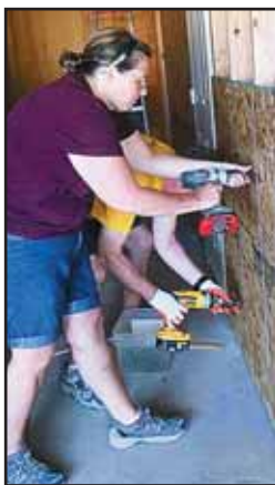
Above: volunteers from Reynoldsburg UMC in Ohio serve in the cafeteria and build storage.