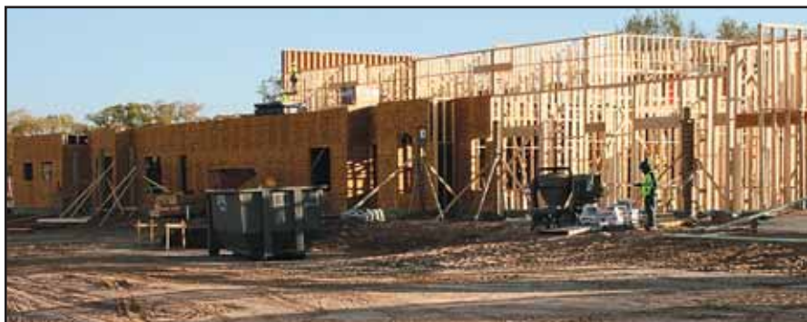
The building framing and sheathing for the first and second stories from the western exposure.