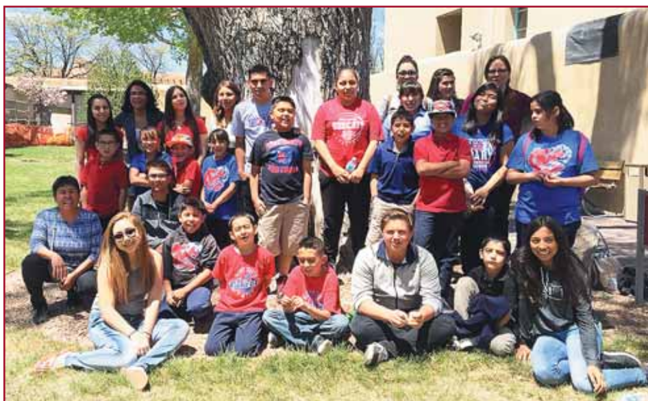
McCurdy Ministries Big Buddies, Little Buddies and the McCurdy Ministries’ counselors and intern enjoy a field trip together to the New Mexico Museum last May.

McCurdy Ministries is helping students and families