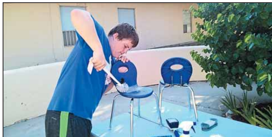
Above: a teen from Center Point United Methodist Church in Texas cleans chairs from the preschool in preparation for the start of school at McCurdy.