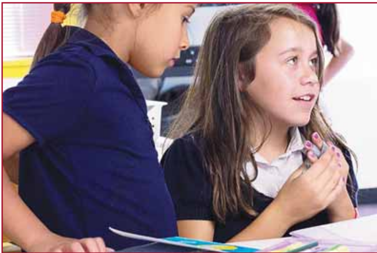
Two ASC students enjoy a craft project.