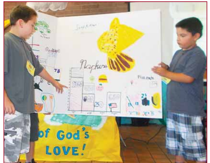
Two Camp Stars students demonstrate their science project.

The “summer slide” is the well documented loss of learning that occurs over the summer break if a student doesn’t participate in a summer learning program. Camp Stars which was created to combat the “summer slide,” is our six week, 35 hours per week, summer educational enrichment camp which includes STEM education (science, technology, engineering and math) learning and faith sharing through Vacation Bible School fun and service. This year 31 campers from kindergarten to 6th grade participated in this camp which includes science experiments, math exercises, field trips, service projects, art, drama, crafts and singing all while learning more about God, Jesus and our Christian faith. We thank the Montei Foundation for being the major donor to Camp Stars for the fourth summer and our donors who make this camp possible.