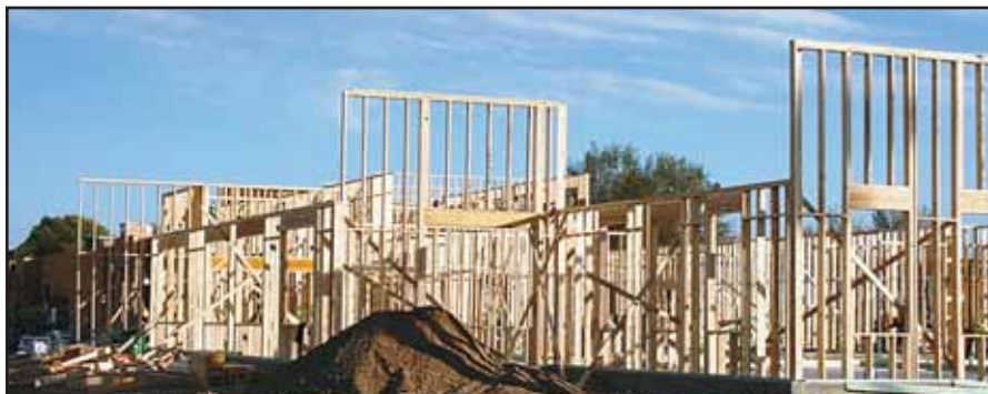
The building framing showing the second story starting to go up. Pictured from the southwest exposure.

Construction on the new McCurdy Charter School building is rapidly progressing. The photo on page three of this newsletter was taken on October 28 and the photos below were taken on Nov. 4. Progress is being made! The construction foreman indicates that the build is on schedule to be completed next spring. Please keep the construction and construction workers building this new building for our children and youth in your prayers.