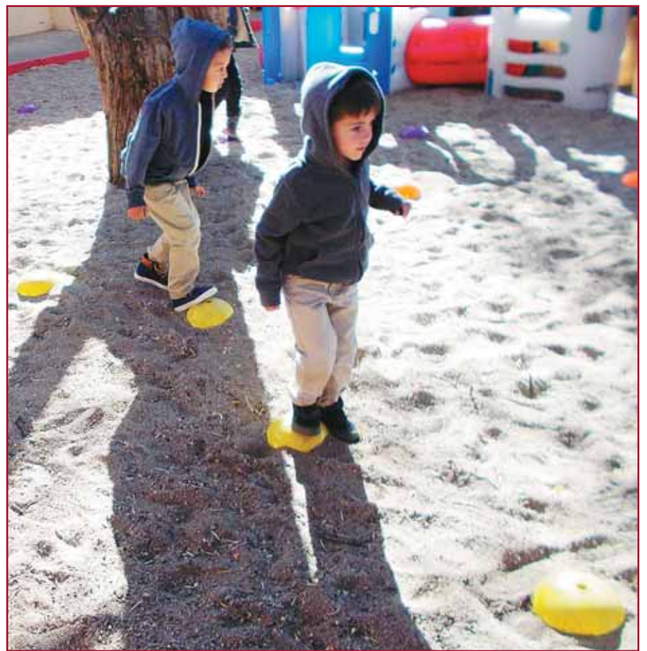
Preschoolers enjoying play ground equipment donated by the Sunday School children of Good Shepherd UMC in Colorado Springs

At McCurdy Ministries we are entering into a time of planning and change. We ask you to be in prayer for our ministries, our students and our staff as we seek to live out God’s will for our future.