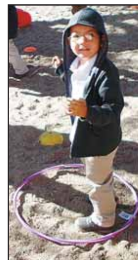
McCurdy Ministries Pre-K students enjoy playing on their playground with equipment donated by the Sunday School children from Good Shepherd UMC in Colorado Springs. It is obvious this donation was a gift of love and a big hit with our preschoolers!