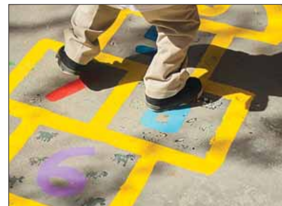
A preschooler enjoys hopscotch on the preschool playground.