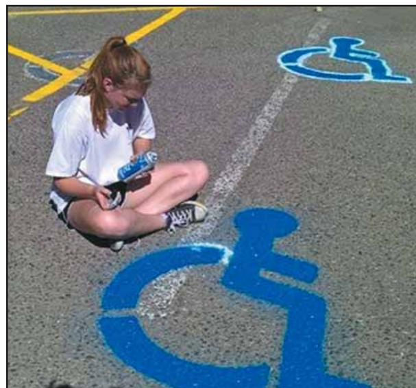
Left: a teen from Center Point United Methodist Church in Texas spray paints handicapped space symbols on a McCurdy parking lot.

Please use our new address which is 362A South McCurdy Road, Española, NM 87532 to mail McCurdy Ministries. If you use our old address your mail will be returned by the post office.