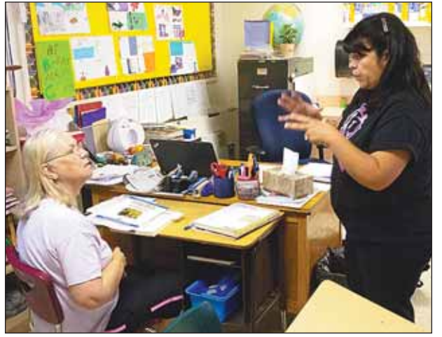
Above: A volunteer and MCS teacher work together to make a difference in the classroom.

Left: Volunteers mix cement for a repair job.