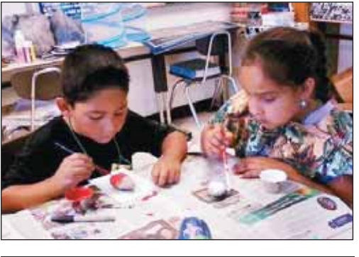
Top left: Camp Stars participants enjoy a craft making session. Bottom left: Camp Stars participants enjoying a science lesson on bubbles at their field trip to the Explora Museum in Albuquerque. Below: Camp Stars smiles

Summer of 2015 was our third year for Camp Stars. Camp Stars is our six week, 35 hours per week, summer educational enrichment camp which includes STEM education (science, technology, engineering and math) learning and faith sharing through Vacation Bible School fun and service. We had 25 campers from kindergarten to 6th grade. Camp activities included field trips to the Explora Museum in Albuquerque and San Martin de Porres Soup Kitchen. Presentations were provided by Zia Credit Union and the Juvenile Diabetes Research Foundation (JDRF). Campers also completed service projects for Habitat for Humanity, Blue Star Mothers, Heifer International and a walk for JDRF. Our dedicated Camp Stars staff included teachers, assistants, and MCS students and graduates acting as guides. We thank the Montei Foundation for being the major donor to Camp Stars, the Carol Williams estate for providing scholarship funds and the donors that made Camp Stars possible through their generosity.