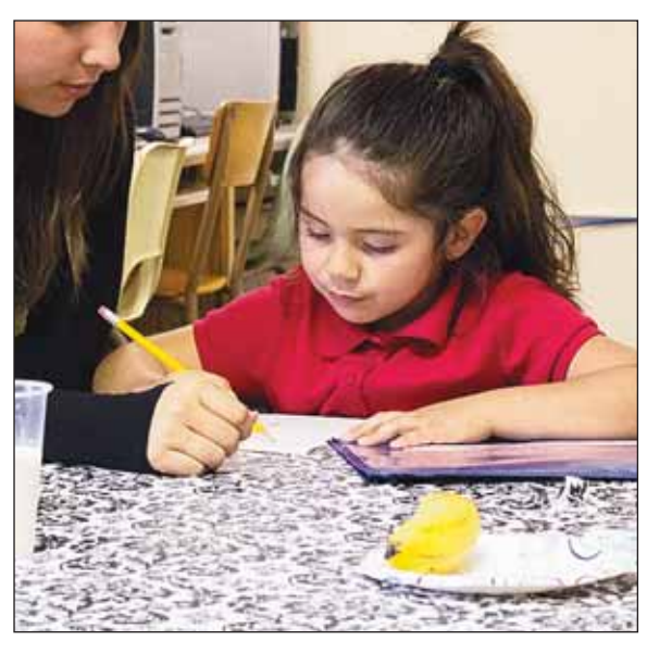
Above: After School Care girl enjoys a snack and homework help.

Left: After School Care boys enjoy a jump.