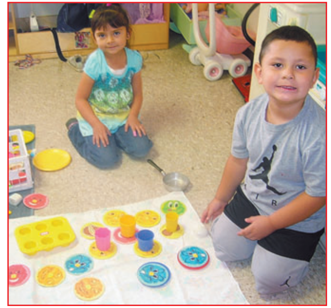
Clockwise from bottom right: 1. After School Care students enjoy the playground. 2. Volunteers sort school supplies. 3. Volunteers and maintenance staff install fiber optic lines. 4. Project Cariño's Big and Little Buddies enjoy a science experiment together at Ghost Ranch in Abiquiu, NM. 5. Camp Stars friends share a peaceful moment. 6. Camp Stars student enjoys an edible engineering experiment. 7. Compa, the Project Cariño Therapy dog relaxes between therapy sessions. Left: 8. Preschoolers enjoy working on a craft project.