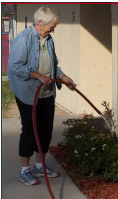
A McCurdy volunteer waters the garden at the retreat center)

The number one time that children get in trouble with drugs, sex, alcohol and the law is 3 to 5 PM so fun, educational faith based After School Care is critical to the safety of our students. McCurdy Ministries cares for 23 preschool to 6th grade students every school day through this faith based program. We look forward to the day when we have additional space to expand this program. At After School Care students experience free play, snacks, homework help, educational games as well as faith building art, crafts, drama and Bible study. A small tuition is charged to help support the program but families that qualify for Free or Reduced Lunch are eligible for financial aid. We are grateful to the donors and volunteers that support After School Care and help keep our students safe while having fun, learning and sharing the faith.