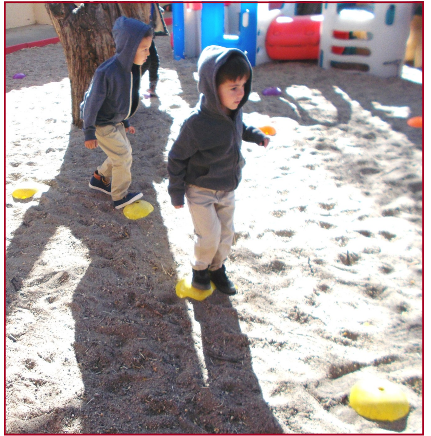
Preschoolers enjoying play ground equipment donated by the Sunday School children of Good Shepherd UMC in Colorado Springs

At McCurdy Ministries we are entering into a time of planning and change. We ask you to be in prayer for our ministries, our students and our staff as we seek to live out God’s will for our future.