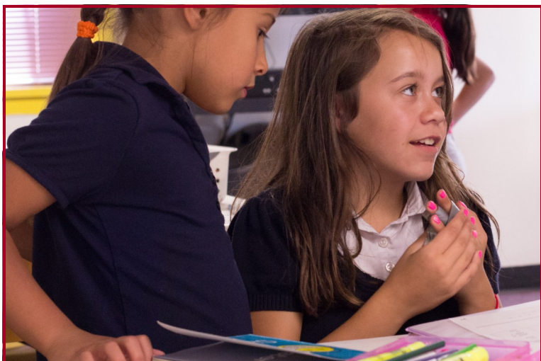
Two ASC students enjoy a craft project.