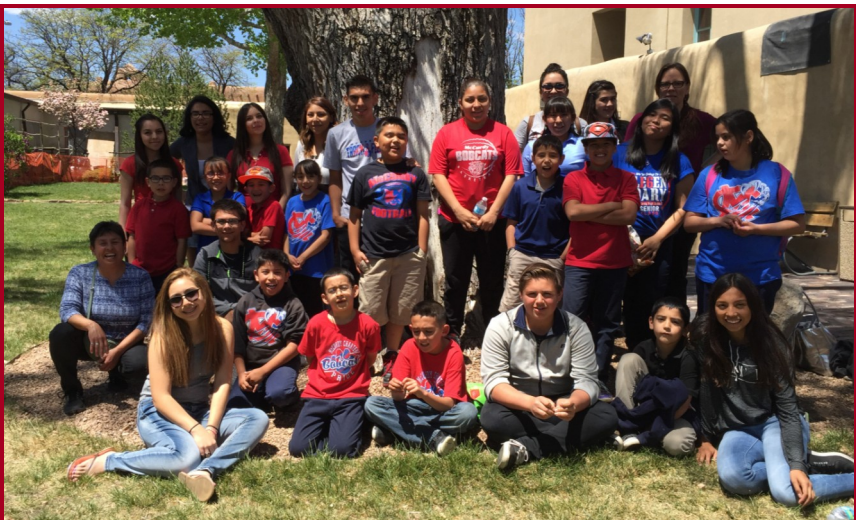
McCurdy Ministries Big Buddies, Little Buddies and the McCurdy Ministries’ counselors and intern enjoy a field trip together to the New Mexico Museum last May.

McCurdy Ministries is helping students and families