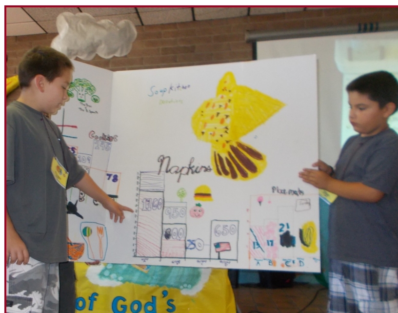
Two Camp Stars students demonstrate their science project.

The “summer slide” is the well documented loss of learning that occurs over the summer break if a student doesn’t participate in a summer learning program. Camp Stars which was created to combat the “summer slide,” is our six week, 35 hours per week, summer educational enrichment camp which includes STEM education (science, technology, engineering and math) learning and faith sharing through Vacation Bible School fun and service. This year 31 campers from kindergarten to 6th grade participated in this camp which includes science experiments, math exercises, field trips, service projects, art, drama, crafts and singing all while learning more about God, Jesus and our Christian faith. We thank the Montei Foundation for being the major donor to Camp Stars for the fourth summer and our donors who make this camp possible.